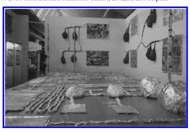
Thomas Hirschhorn. Tränetisch. Kunstmuseum, Luzern, 1996.