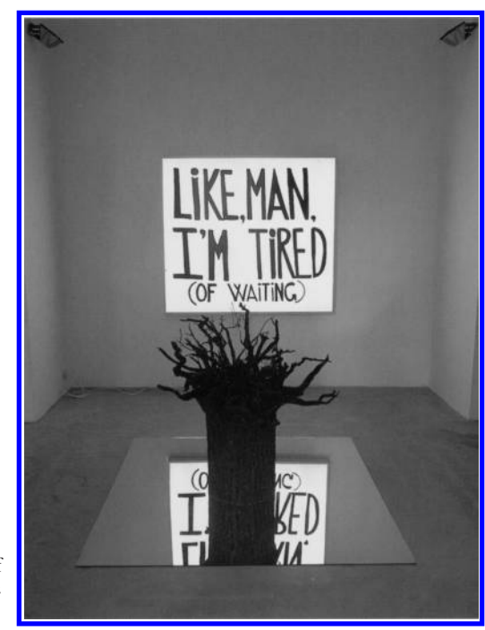
Durant. Like, Man, I'm Tired of Waiting. 2002. Courtesy the artist, Blum and Poe, and Galleria Emi Fontana.

"partially buried." "I read it as a grave site," Durant says of Partially Buried Woodshed , but it is a fertile one for him. ^{52}